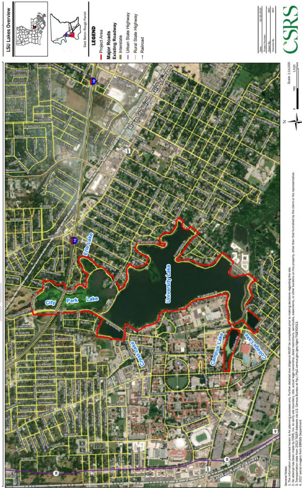
EXHIBIT 1 ESTIMATED LIMITS OF WORK