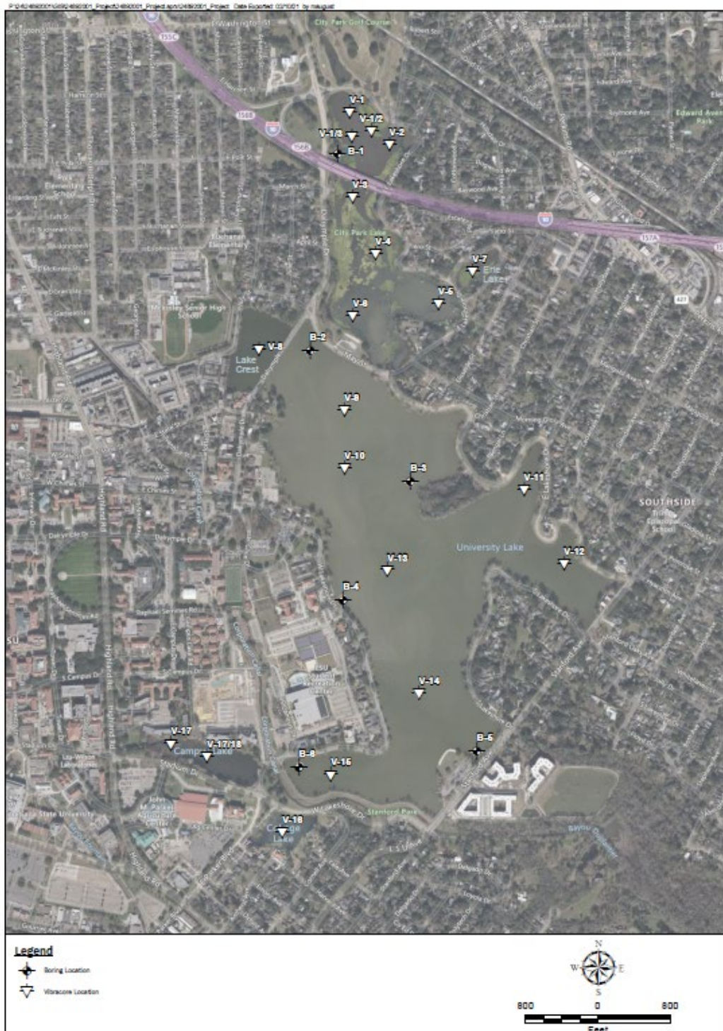
Exhibit 1 Page 2 of 2

V-# = sediment sample using a vibracore 10ft max depth; B-# = geotechnical soil boring using a drill rig 20 ft max depth; GEC-# = 2006 sediment sample locations